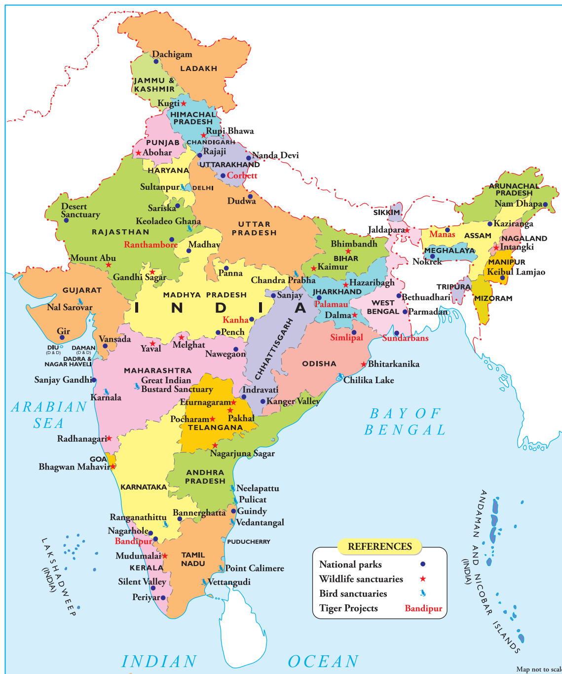
important national parks and wildlife sanctuaries in India

Please refer to the updated map of India given below in place of the map given on page 252 of the coursebook.