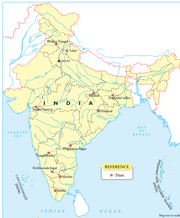
map of India showing the location of some dams

Please refer to the updated map of India given below in place of the map given on page 314 of the coursebook.