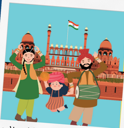
cultural dance show at Red Fort New Delhi 14th May 2024

This programme will give students an opportunity to observe, reflect, and creatively document their travel through videos and photographs - turning every trip into a learning journey.