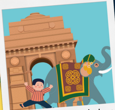
India Gate elephant show 21st August 2024